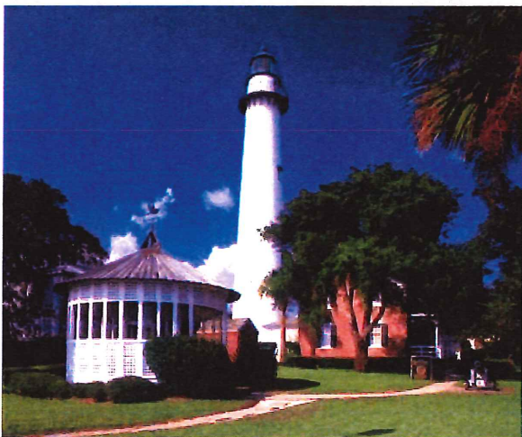
Tybee Island Lighthouse